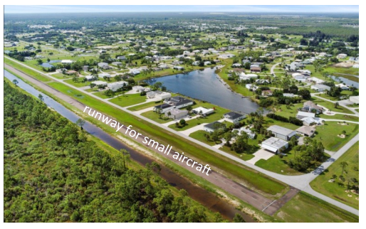
North Ft Myers: Runway next to the road leading to the residential area

again by Florida, a settlement could be designated with a runway for small aircraft, where planes can be parked in one's own garage. This would make Havelberg appealing to people within a 350-kilometer radius.